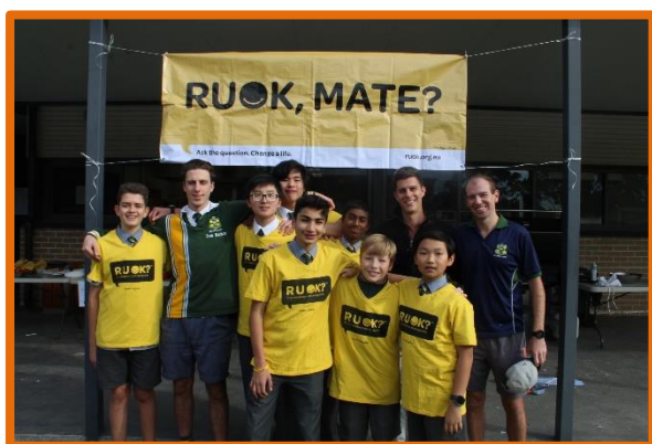
R U OK? Day