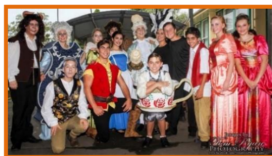
Beauty and the Beast