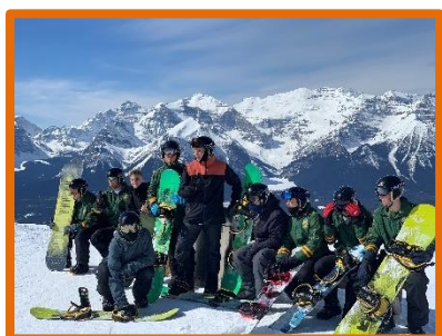
Canada / USA Tour