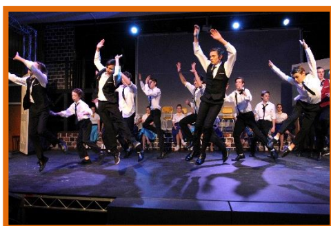
West Side Story