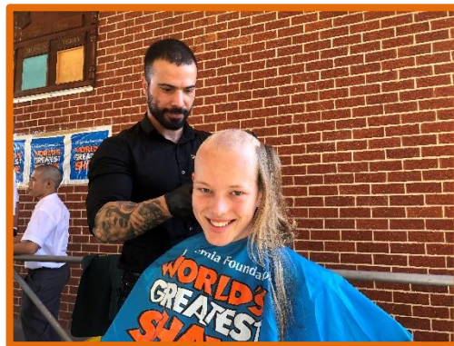
World's Greatest Shave