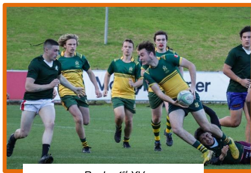
Rugby 1 st XV