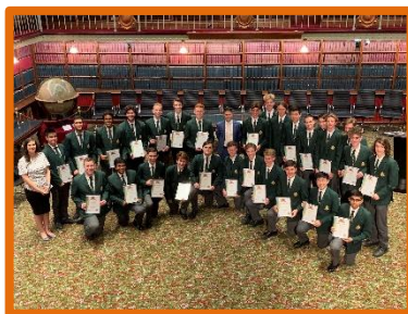
Leadership Day at Parliament House