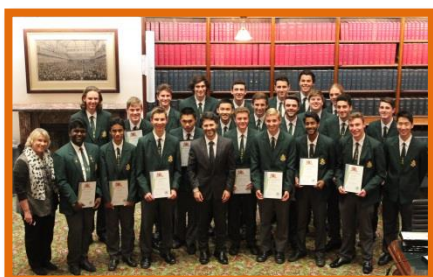
Leadership Day at Parliament House

Debating Duke of Edinburgh's Award Scheme Gardening Club House/Sports Captains Network Cafe Panorama Magazine Committee Peer Mediation Prefect Body Public Speaking Students' Representative Council