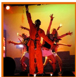
Jesus Christ Superstar