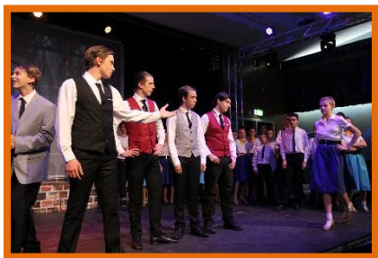
West Side Story