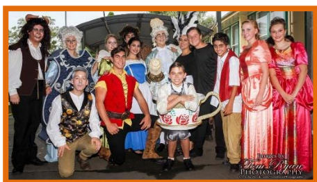
Beauty and the Beast

Previous productions were West Side Story (2017), Beauty and the Beast (2014), Jesus Christ Superstar (2008), Bye, Bye Birdie , Guys and Dolls and How to Succeed in Business Without Really Trying . The enthusiasm and hard work results in productions that are satisfying to cast and crew and enjoyed by all who are involved. Future productions will be advised.