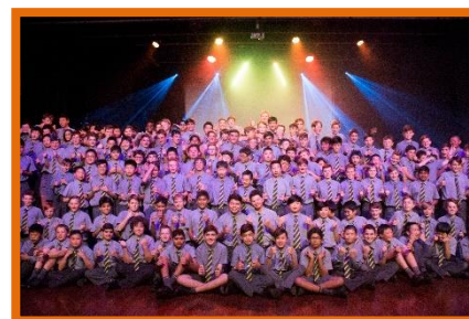
Year 7 Massed Choir