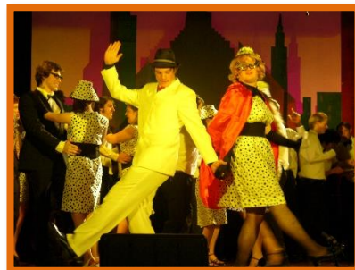
How to Succeed in Business Without Really Trying