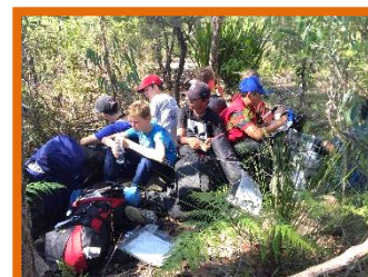
Duke of Ed walk

Selected Year 9 students have an opportunity to work in our Network Café one day per week, serving morning tea to staff and senior students. The following year nine students are then selected to progress to the Year 10 cafe management team. They work a number of rostered shifts per week, as the café opens before school and at recess every day. These boys also mentor the next group of Year 9 trainees in the procedures of the café, providing a superb leadership opportunity. The management team is then streamlined further as the students enter Year 11, with four boys forming an executive management team to oversee operations and directions.