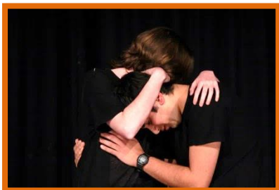
Drama Performance Evening