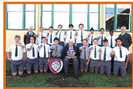
2017 winners of the Davidson Shield