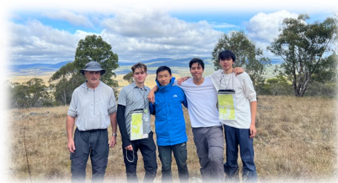
Gold Duke of Edinburgh Adventurous Journey

This sports leadership team work on the three school carnivals, as well as other sporting events to support the organisation and operation of these events. They work closely with the Sports Coordinator, Carnivals Coordinator and Head Teacher PDHPE.