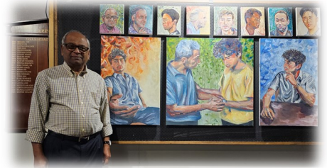
HSC Body of Work