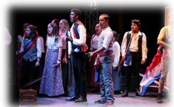
Les Misérables 2019

Previous Musical productions were Les Misérables (2019), West Side Story (2017), Beauty and the Beast (2014). The enthusiasm and hard work results in productions that are satisfying to cast and crew and enjoyed by all who are involved. Productions are open to all students in production years.