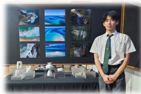
HSC Body of Work