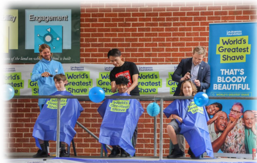
World's Greatest Shave