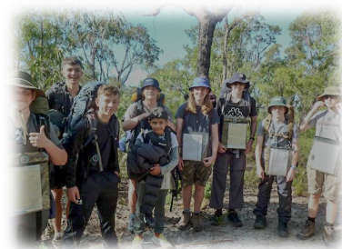
Duke of Edinburgh Adventurous Journey

Each stage of the award has progressing levels of commitment to each field. These are outlined below.